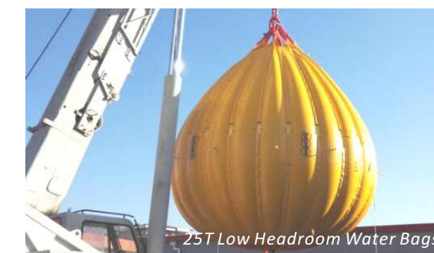
25T Low Headroom Water Bags