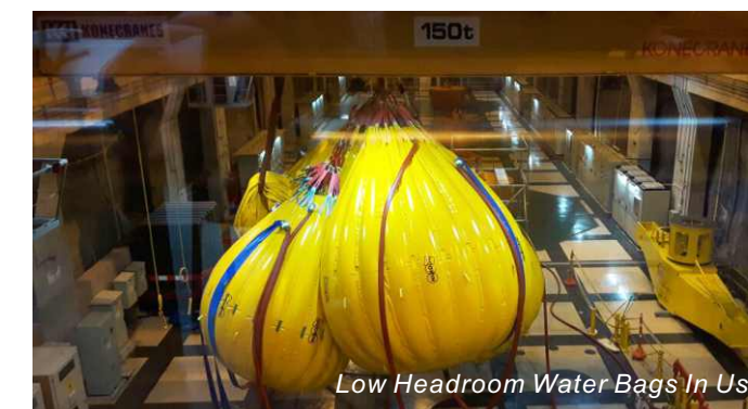
Low Headroom Water Bags In Use